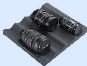
Wavefoam for Lenses (for selected models only)

1) Pull out tray and lift tray at a 45° angle to remove tray from the track.