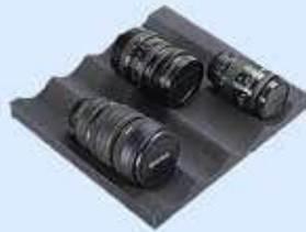
Wavefoam for Lenses (for selected models only)

1) Pull out tray and lift tray at a 45° angle to remove tray from the track.